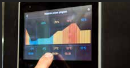
User-friendly touch function control panel simplifies everyday life.

Choice of colors: Neutral stainless steel or black.