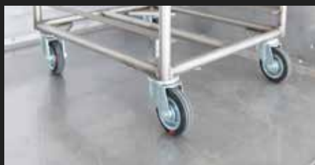
Insulated heated floor that prevents cold damage to underlying materials.