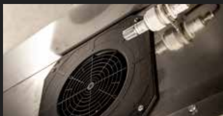
Fans run on demand to save energy and provide the perfect proving climate.